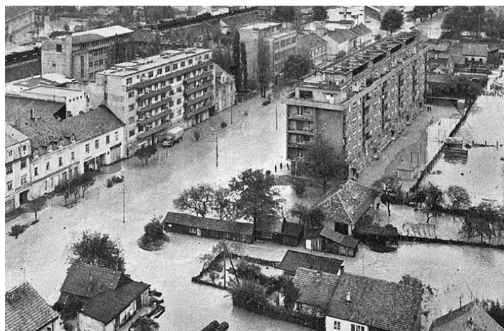
Figure 1. The flooded area of the city center on the axis of Savska road (author: Šime Radović)

by the most up-to-date technique at that time (Wolfsche-Gehäugebau), which was successfully applied by the Croatian experts on the basin of Sava river after an engineer named August Wolf applied it for the regulation of river Isar. As the stream of the Sava river near Zagreb is cut into gravelly pebbled layers, which, by constant rotation of the large impurities, causes frequent migrations of the cedar and thus creates specific geological conditions, the old sleeves should be covered within the regulation. (Slukan Altić, 2010). Since the end of the World War II, the regulation that had been implemented had succeeded in stimulating the intensive urbanization of parts of the area between the river Sava and the railway line, and it was a solution for safe further expansion (although there was an outbreak of hinterland flooding), until the catastrophic flood in 1964. The reason for this largest flood in the Zagreb area that happened on the night of 25th to 26th October, was the cracking of the existing embankment. Sava river flooded one third of Zagreb area, and the water covered more than 6,000 hectares of narrow urban area, where more than 180,000 people lived. Flood levels are shown in Figure 1 showing the area of the Savska road axis.