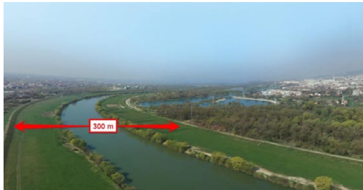
Figure 2. Defensive embankments along the river Sava through the urban area