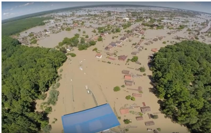
Figure 4. Part of the flooded area in Vukovar-Srijem County

With the timely engagement of county, city (Županija) and municipal protection and rescue units and civilian protection commands, along with the Croatian Army, police, operational forces, volunteers and many other institutions and citizens, it was managed to protect the most critical points on the embankment (Vukovar-Srijem County, 2014.). Unfortunately, two human lives were lost in the floods with great material damage (some direct and indirect damage indicators, complete damage was measured in billions of kunas). The lucky circumstance was that there was no transmission of infectious diseases, and no cases of property crimes or events that would have affected the deterioration of the security situation (DUZS, 2014). After the flood, the City of Zagreb reacted immediately and engaged in raising funds for people who had been affected. On several occasions, assistance was provided in the form of household appliances, materials for the reconstruction of the interior of the houses along with drainage appliances in the Posavina county, and among other things, free textbooks were provided for pupils and students of elementary and high schools in the affected area (City of Zagreb, 2014).